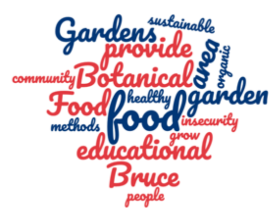
Key words used by workshop participants in helping to develop this vision statement.

The following presents the results from this process.